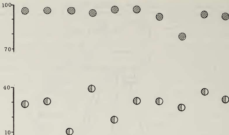
Figure 2. Blattella germanica , untreated insects. Above, both phases of the repellent MGK R-874 present. Below, liquid MGK R-874 only present (suction fan on). Indices of repellency averaged at intervals of 10 readings, showing that there is no consistent decrease in the repellent effect over the period of time that the tests were run.

There is another reason why single insects were used rather than batches of insects. If several readings are taken of the distribution of a single insect in the test chamber, the data produced must follow a binomial pattern since the insect can only be counted as on the treated side of the chamber or not. The resulting ratio of readings on the treated side versus readings on the untreated side will give an estimate of the probability of the insect being on the untreated side, which is a measure of the degree of repellency for that insect alone. If the experiment is repeated using different insects, a measure can be obtained of the variability of this degree of repellency within the insect population. This variation may not be binomial; indeed, it is more likely to follow a normal pattern, since it is the variation shown by a natural population in response to a repellent substance. If a batch of insects is used, say 10 at a time, and an average of three counted on the repellent treated side, unless each insect is marked and counted separately we have no way of knowing whether each insect spent three-tenths of its time on the treated side, or whether three insects spent all their time on the treated side and seven insects spent all their time on the untreated side. Thus we have no measure of the variability of the repellent effect within the insect population.